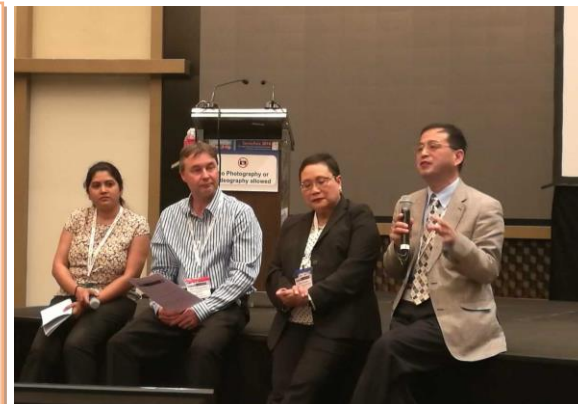
FOP WORKSHOP Q&A SESSION